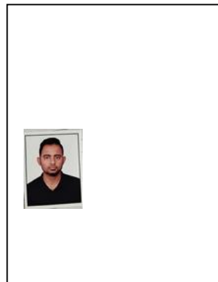
Too Small X