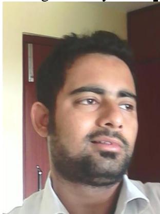
Facing Sideways X