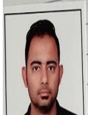
Too Close X