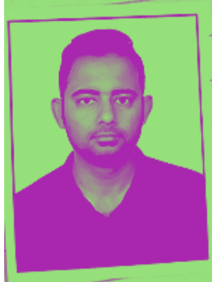
Too much Extra Color X