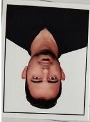
Inverse Photo X